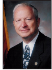
Mayor Jack Kirksey